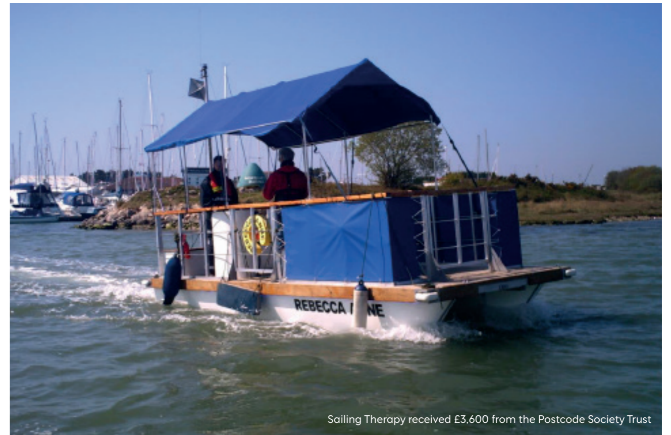
Sailing Therapy received £3,600 from the Postcode Society Trust