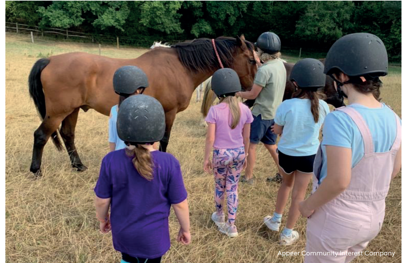
Apper Community Interest Company

The Trust-Based Philanthropy Conundrum: Towards Donor-Doer Relationships That Drive Impact, April 2024